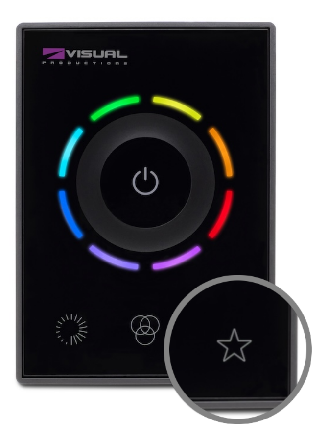
Figure 3.5: Favourite

To recall, all you need is a short press on the icon. This results in the change of the lights, and a short pulse in the panel as confirmation.