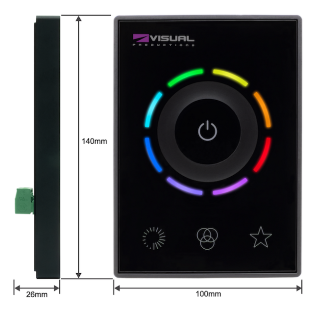
Figure 1.3: Encolor T10 dimensions