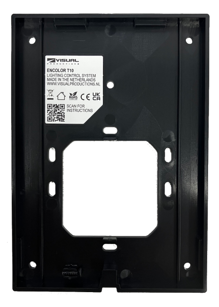
Figure 2.4: Wall mounting the Encolor T10

The Encolor T10 is wall mounted. The unit fits directly on standard flush mounted gang boxes. See figure 2.4. Mount the backplate to the gang box or wall with four screws (not supplied). Make sure to take note of the correct orientation of the backplate. Make sure power and DMX cabling are in place in the gang box, and correctly attached to the supplied screw terminal. On the inside of the backplate you will find a screw to secure the Encolor T10 to the backplate. Connect the terminal to its counterpart on the back of the Encolor T10, and push the push the unit gently over the backplate until it clicks in place. Then fasten the unit by using the screw in the downward facing side of the enclosure.