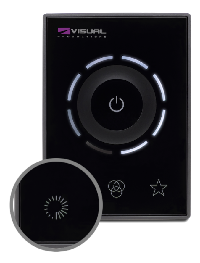
Figure 3.1: Intensity

To control intensity, touch the intensity icon (fig. 3.1). The Encolor T10 will show a gradient of white light around the control wheel, which is now set to change the intensity.