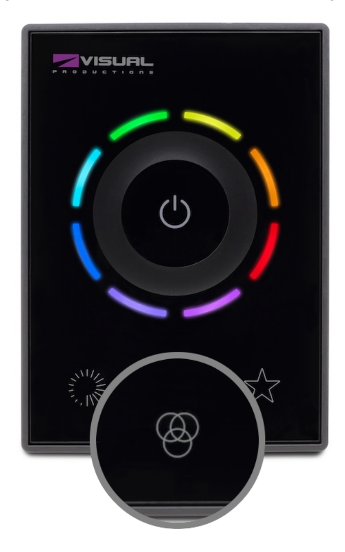
Figure 3.2: Colour

To control Colour, touch the colour icon. The Encolor T10 will show a ring of coloured light around the control wheel, which is now set to change the colour.