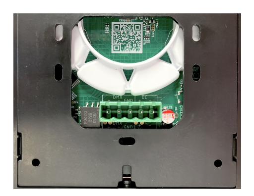
Figure 2.3: Terminal connector, seen through the backplate

The DMX cable is connected to the Encolor T10 via the free slots on the screw terminal that is already connected to the power supply. The correct wiring is also noted on the circuit board. See figure 2.3 for the terminal connector on the Encolor T10.