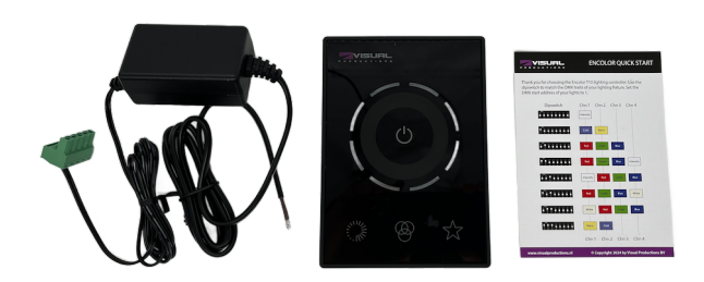
Figure 1.2: In the box