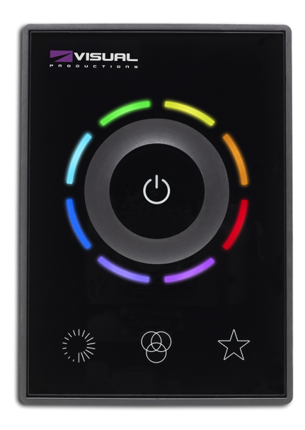
Figure 1.1: Encolor T10

An ideal solution for a stand-alone DMX installation of a single DMX-512 group, as the Encolor T10 takes care of the daily control of the light fixtures.