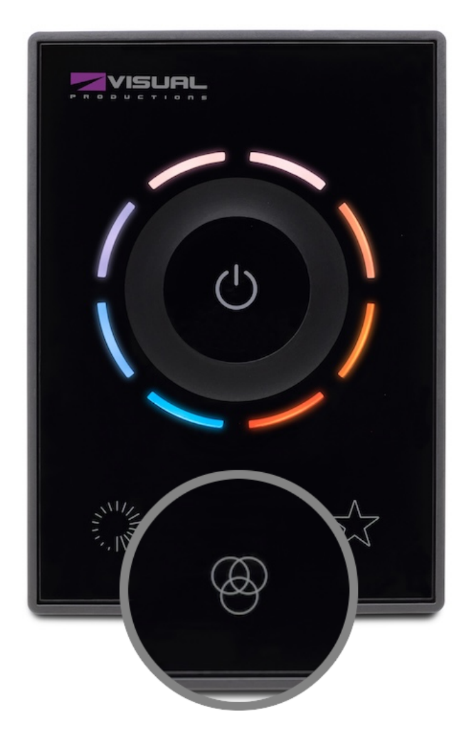
Figure 3.3: Colour Temperature

To control Colour Temperature, tap the colour icon until you see the Encolor T10 show a ring of cold to warm light around the control wheel. fig. 3.3 The wheel is now set to control the Colour Temperature.