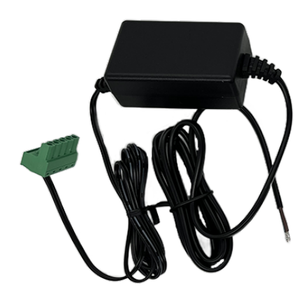
Figure 2.2: Power Supply Unit

The Encolor T10 requires a DC power supply unit (PSU) between 9 and 24 Volt with a minimum of 500mA. The DC connector is a two-pin screw terminal. Supplied is a 12VDC PSU with attached terminal connector on the 12V side. Be advised that the connector for mains power will have to be supplied by the customer. The PSU is rated for 100-240VAC input.