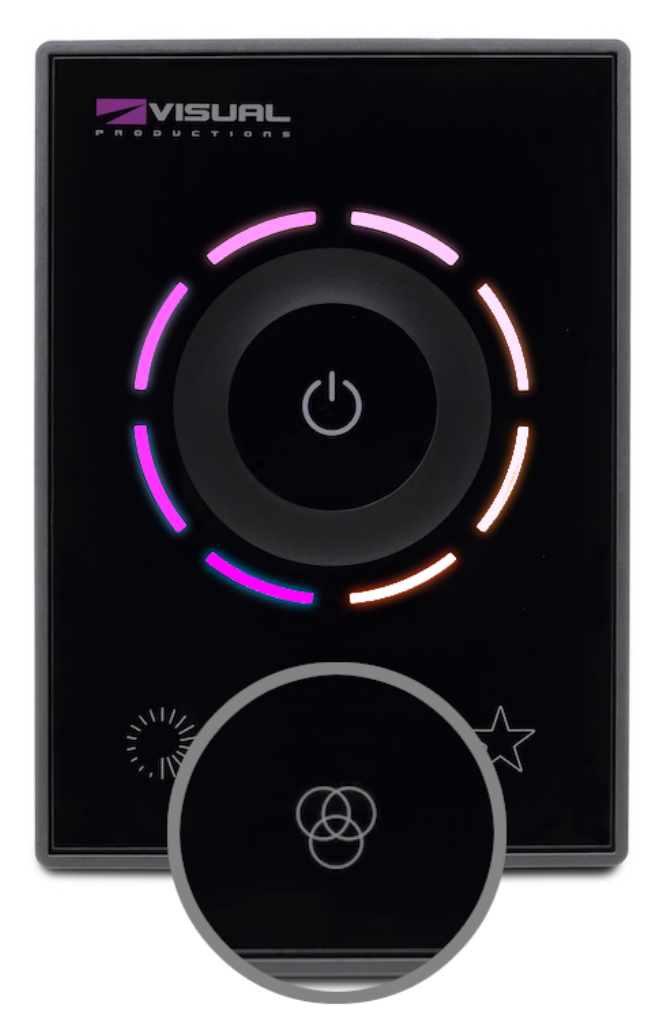
Figure 3.4: Colour Saturation

To control Saturation, tap the colour icon until you see the Encolor T10 show a ring of chosen colour to white light around the control wheel. fig. 3.4 The wheel is now set to control the Colour Saturation.